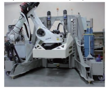
(b) American aerial drilling composite robot