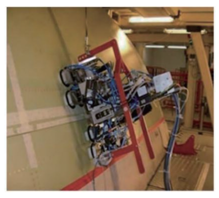
(a) Spanish TLD aerial drilling composite robot