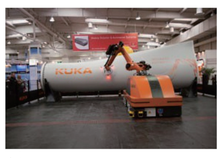
(a) KUKA composite robot handling platform

greatly improving the handling efficiency and production flexibility of large components in aviation assembly (Fig. 4(c)). The application of these technologies reflects the important position of composite robots in the manufacturing industry, and is expected to play a great role in the future<sup>[28,30]</sup>.