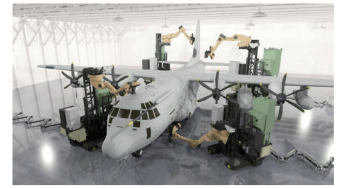
(b) Carnegie Mellon University military aircraft surface coating laser stripping system Fig. 3 Typical spraying composite robot system

At present, there are relatively few researches on surface spraying in China, which mainly focus on the configuration and motion simulation of composite robots<sup>[21]</sup>. Many scholars have thoroughly analyzed the kinematics and dynamics of spraying robots to solve the problems of motion flexibility, workspace and unique configuration of spraving robots. Zhao et al.<sup>[22]</sup> used a robot positioner to extend the working range of the spraying robot to fully cover the spraying area of the aircraft tail, and used a laser tracker to monitor the position and spatial attitude of the aircraft. Miao et al. <sup>[23]</sup> proposed a robotic system suitable for automatic spraving of large free-form surface products ( such as aircraft), introduced the mechanical structure layout and control system structure of the system, and studied the key technologies in spraying operation planning, such as aircraft pose calibration and spray gun trajectory planning, after analyzing the spraying operation process. They also developed control system software